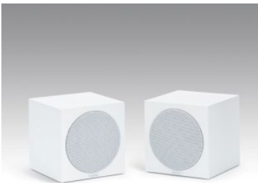
Revox Piccolo S60 white