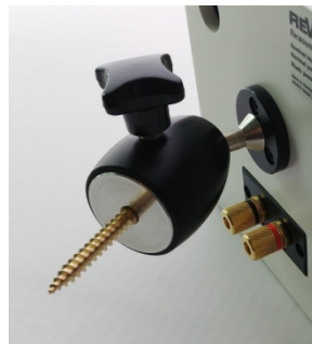
Wall bracket Piccolo S60