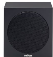
Revox Piccolo S60 black