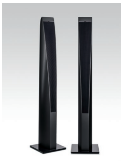
Revox Scala 120 black

Our sound engineers developed a special milling process and a coordinated gluing and pressing system specifically for the production of our highly complex wooden speaker cabinets. The speaker cabinet walls, made of glue-laminated layers of wood, are stiffened multiple times and shaped to prevent the formation of additional standing waves. The appeal of the Scala lies in its handcrafted finishing of the finest quality.