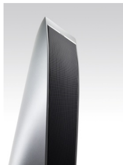
Revox Scala 120 Detail