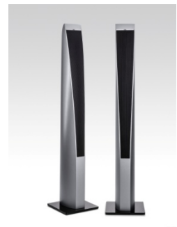
Revox Scala 120 silver